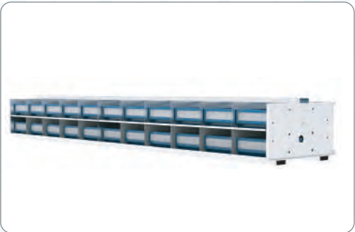
Rack types with seperator and tackle