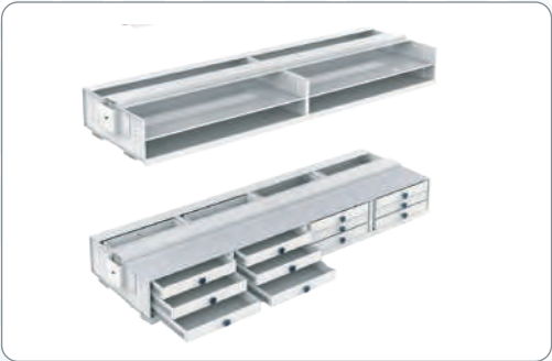
Rack type with and without drawers