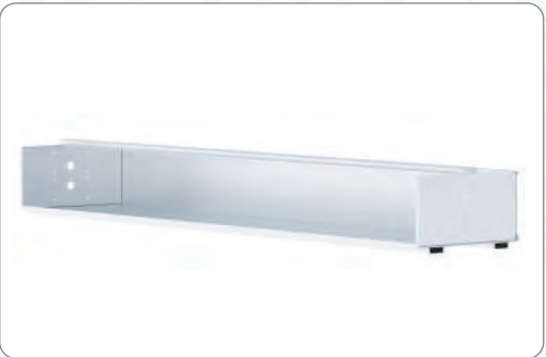
Large size rack type