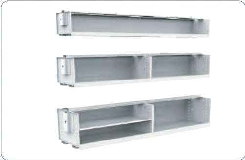
Gradual and non gradual rack type